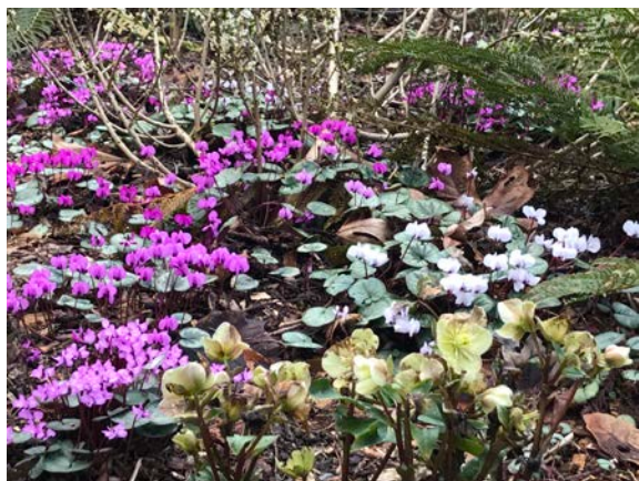
Spring has sprung in the Arboretum