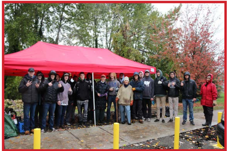
Sigma Chi Fraternity helped spread chips