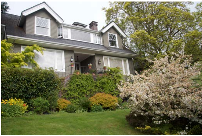
The front porch is a fabulous vantage point to look at Lake Washington