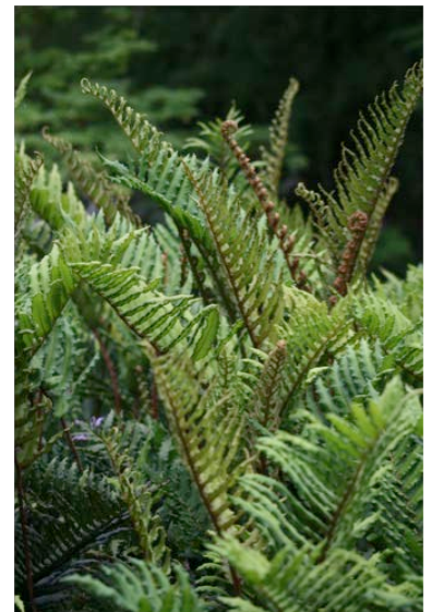
Blechnum chilense Chileanhard fern