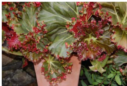
Begonia with fall color