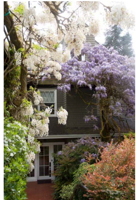
Two amazing wisterias (purple and white) have graced the backyard since the 1940's.