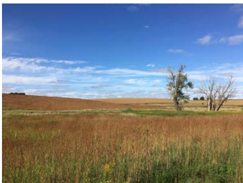
View of prairie grasses.