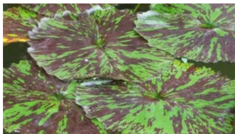
From the Tropical Water Lily family, Nymphaea sp