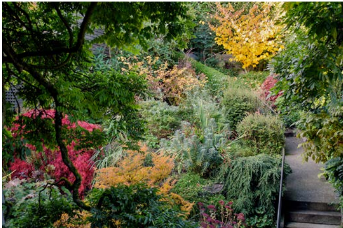
Jenny loves fall colors and imaginative textural contrasts. The combination of emotion and scientific knowledge have shaped this beautiful garden.