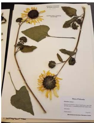
Floral specimen of Helianthus annuus L.