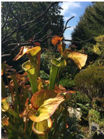
Left, Sarracenia s from the Miller Garden,