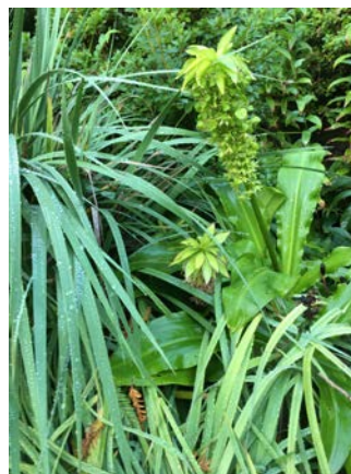
Left, Eucomis autumnalis From Diana Neely's garden. It is an herbaceous perennial and a hardy bulbous deciduous plant with medicinal uses.