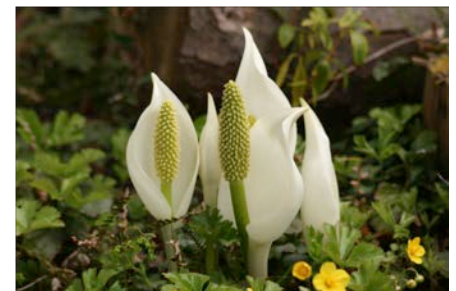
Lysichiton camtschatcensis White skunk cabbage