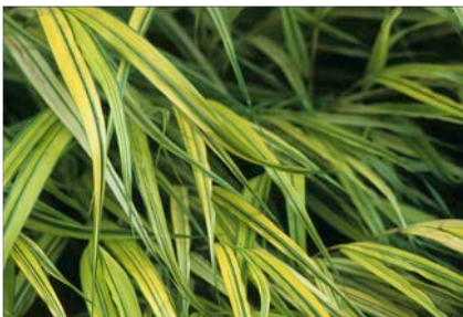
Hakonechloa macra 'Aureola' Golden Japanese forest grass