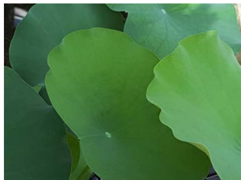
From the Lotus family, Nelumbo nucifera