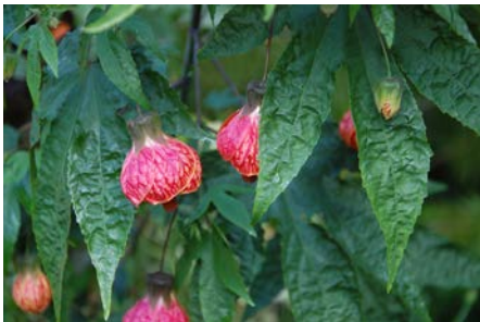
Abutilon dictum in pink and orange