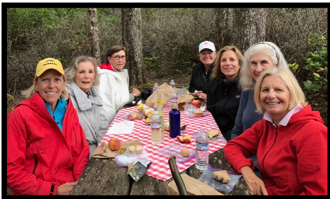
Garden Club members and guests took a weekend trip to Pyscht - a family lodge on the Olympic Peninsula and part of the Merrill and Ring timber holdings.