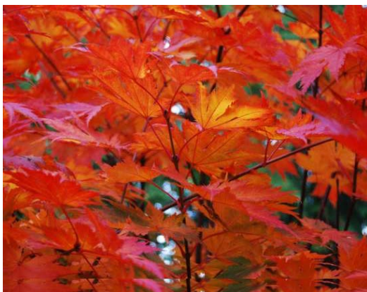
Acer japonicum 'O-isami'