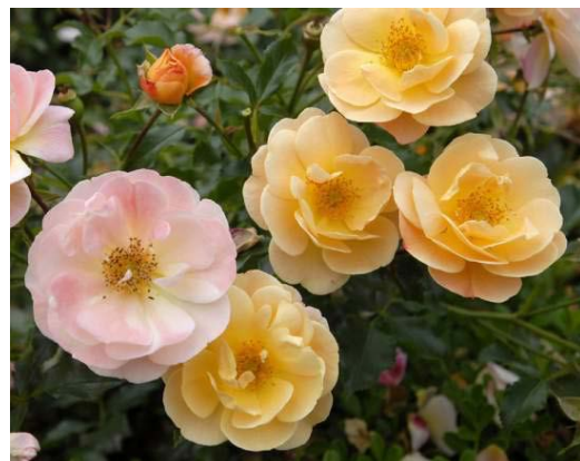
Rosa X 'Flower Carpet Amber'