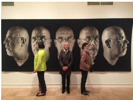
Club members enjoying the Chuck Close exhibit at the Henry Art Gallery.