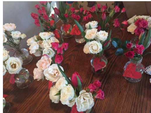
Valentine's Day Arrangements