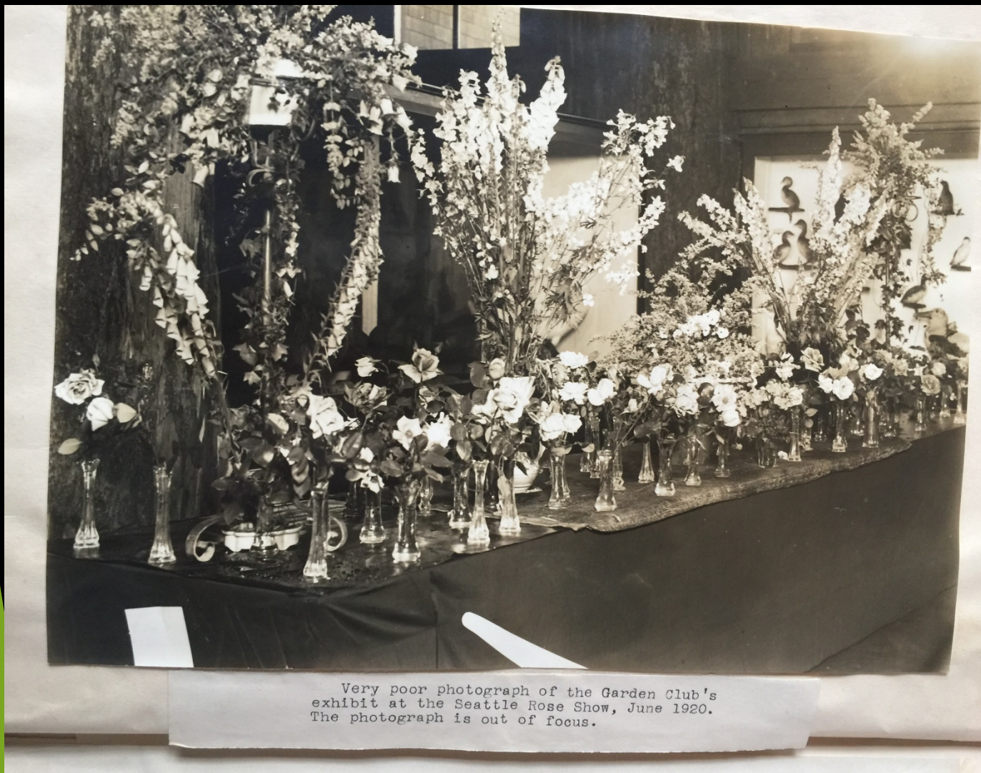
Very poor photograph of the Garden Club's exhibit at the Seattle Rose Show, June 1920. The photograph is out of focus.