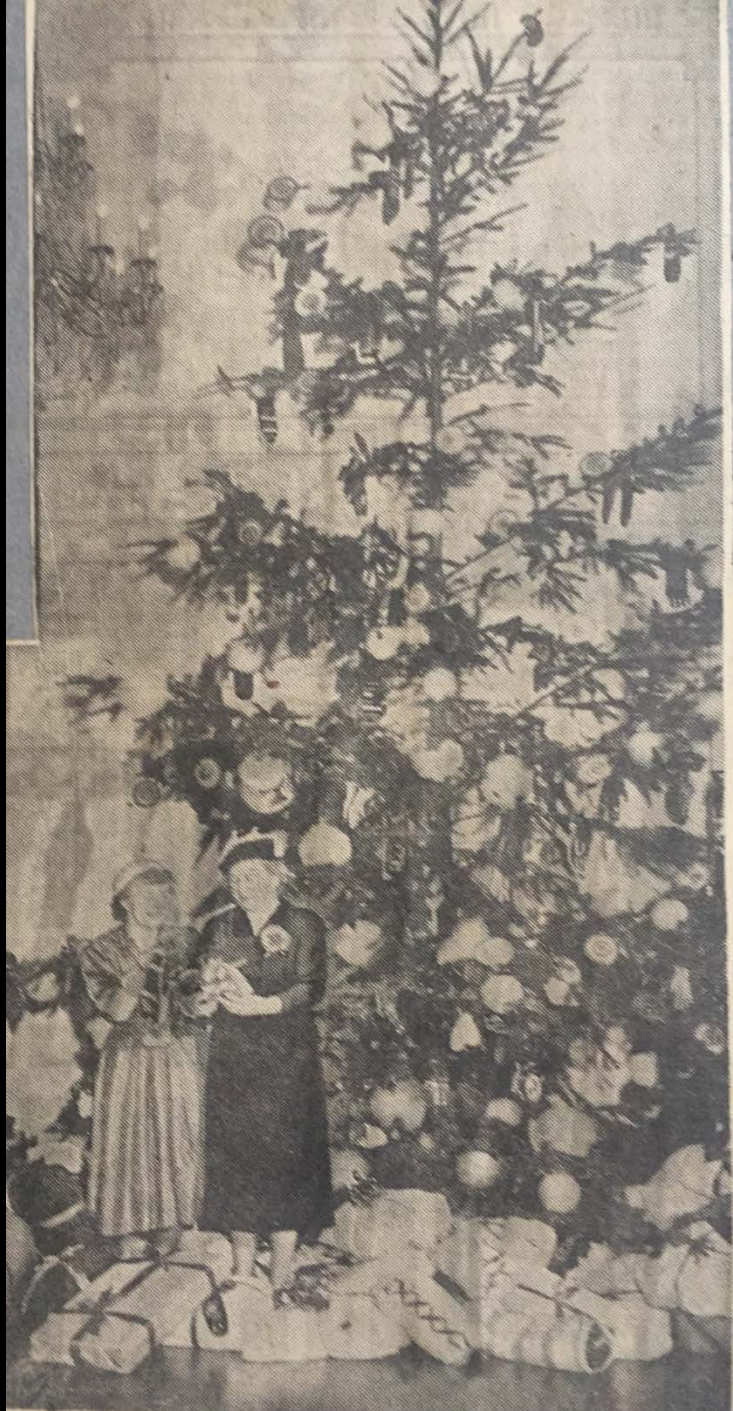
ted mittens deco- , Towel" bundles containing children's clothes which