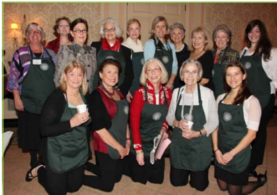
Ways & Means are joined by other volunteers to help the Auction process run smoothly