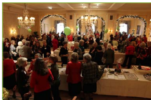
Members enjoy holiday cheer and the lovely setting while supporting SGC fundraising