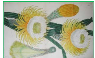
Print from Botanist's Repository of "Cactus grandiflora"

On a recent college tour in New York City with my son, I was hoping to make a detour to the Library at Garden Club of America's headquarters. A copy of Henry Andrew's Botanist's Repository is housed in a temperature controlled room there and available, upon request, for viewing. This ten-volume book was published in London between 1797 and 1812. Andrew himself drew, engraved and hand-colored each print and then wrote about the plant's virtues. Because the volumes were relatively inexpensive and readily available, the popularity of amateur gardening soared after it was published. People were able to identify plants and their best growing conditions.