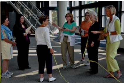
Will the Maritime Event Center measure up?