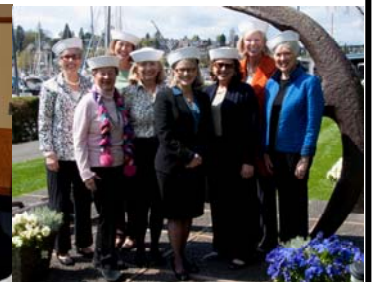
Some of the Steering Committee