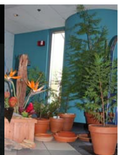
Nowhere to go but home . . .