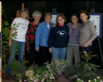
Conservation members worked hard to present an award-winning display