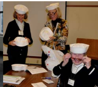
Fun with the maritime theme