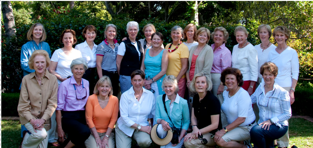
The Visiting Gardens trip to the Pasadena area this past month, was enjoyed by many SGC members.