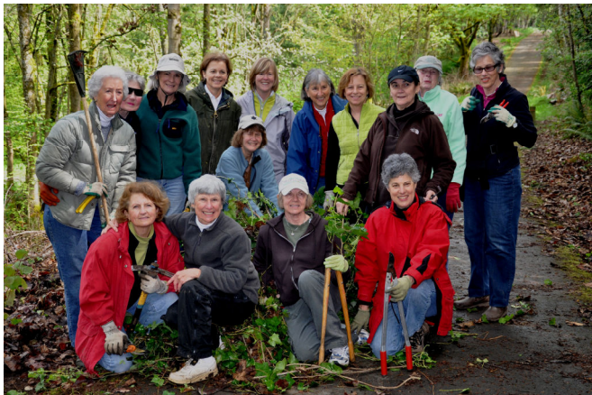
SGC members joined forces to help eradicate ivy and blackberry along Wetherill paths.