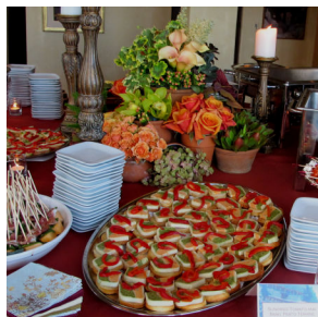
A lovely buffet table