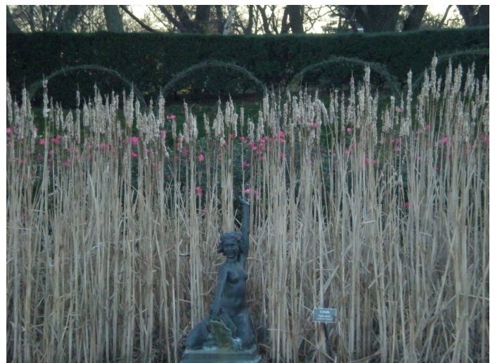
Brooklyn Botanical Garden