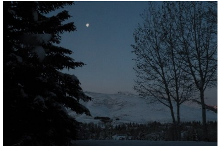
Sun Valley sunrise