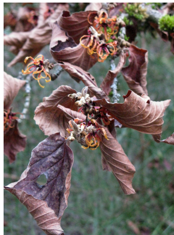
Corylus maxima 'Purpurea'