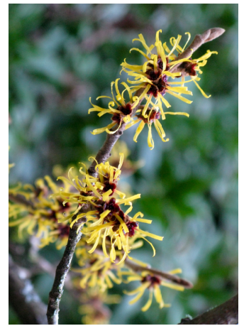
Corylopsis, Witch Hazel

Share your garden interest, new discoveries, color combos, survivors, visited gardens, surprises or disappointments. Your photos will be appreciated! Suzette de Turenne sdeturenne@comcast.net