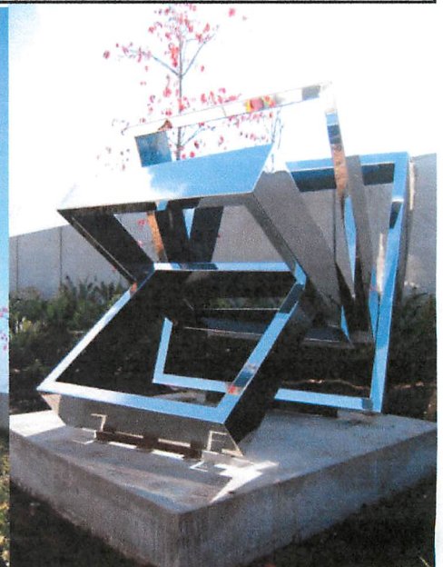
Olympic Sculpture Garden Photos