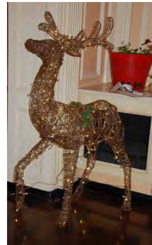
Rudolph stops in for a visit

It was ALL ABOUT RED at this year's fabulous Seattle Garden Club Auction and Luncheon. With the Sunset Club all decorated for the Holidays and our lovely: red-themed centerpieces adding pops of color throughout, it could not have been lovelier. The auction provided many opportunities for supporting SGC, and the early numbers show we have made over $36,000 for Community Projects!