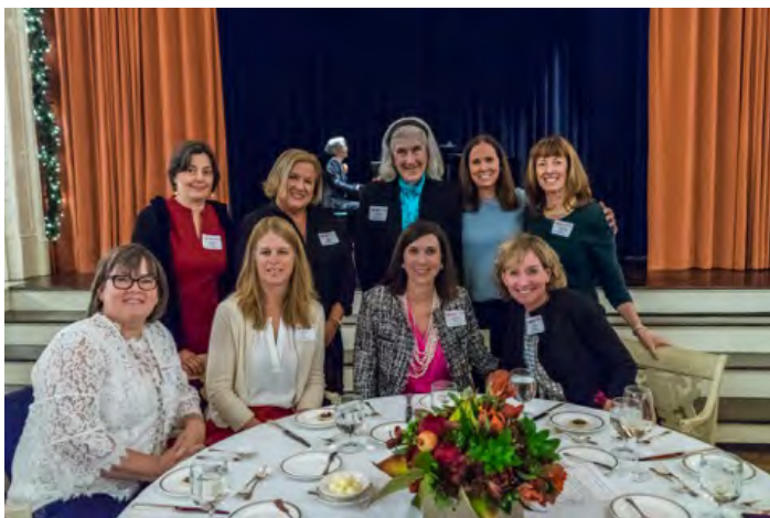
The Provisionals and Burnley playing in the background