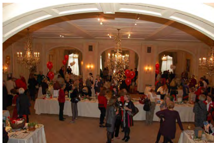
The bidding begins!