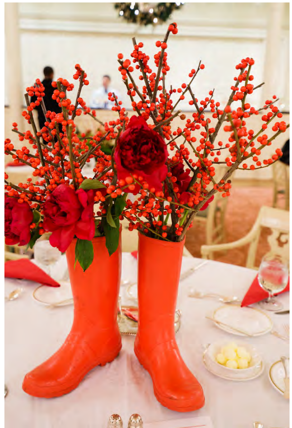
Candy Lancaster's arrangement