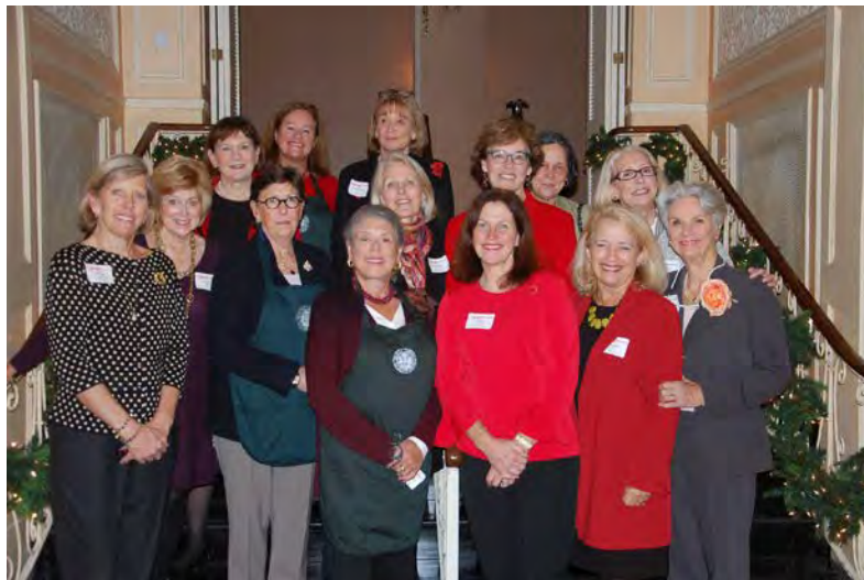
Many thanks to our dedicated Ways & Means Committee!