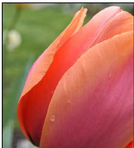
Colorful spring tulip