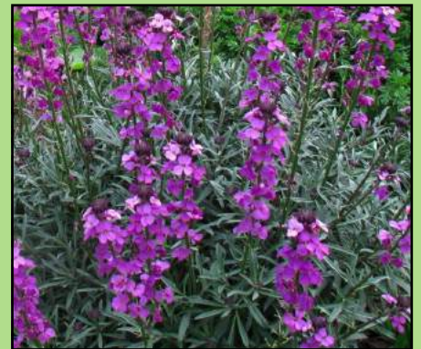
Erysimum 'Bowles Mauve'

Perhaps the biggest spoiler alert: best to “edit” your garden as early in the season as possible. These little darlings can take up to a couple months to “harden off” and not need daily watering. Get them established before that heat of ours arrives. I don't know about you, but I don't want to be running around in August watering, desperately trying to keep my newbies from withering.