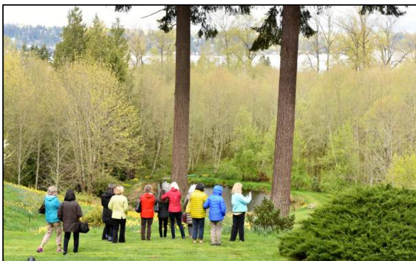
Beautiful garden filled with spectacular daffodils