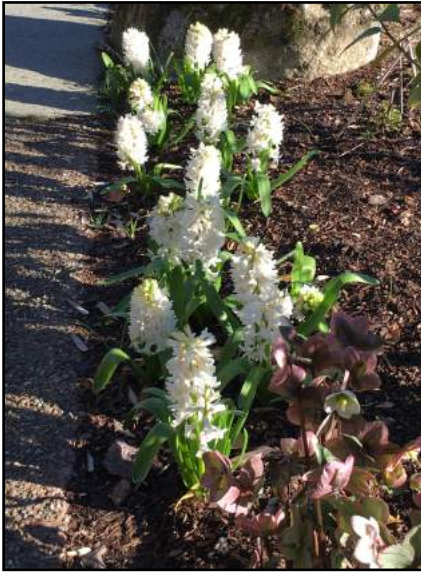
Hyacinth 'Ito'

The Fragrance Garden Committee invites you to weed on May 5 from 1-3 pm in the Fragrance Garden at CUH!