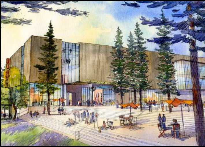
Future plans for the Burke Museum that were presented at the April General Meeting