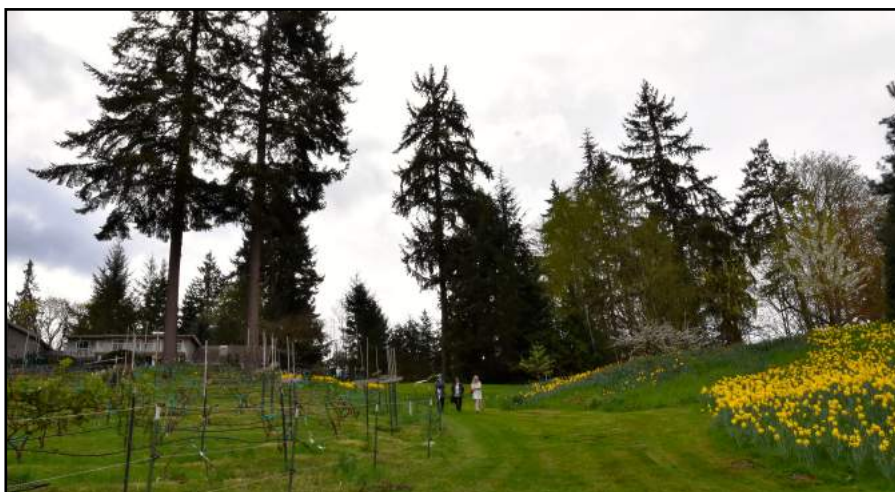
Another lovely garden view