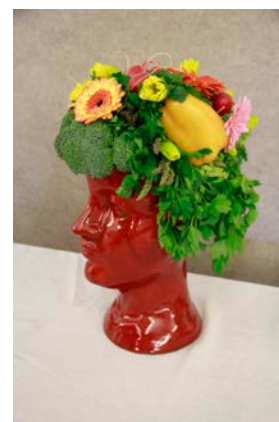
Suzy Titcomb's floral bonnet