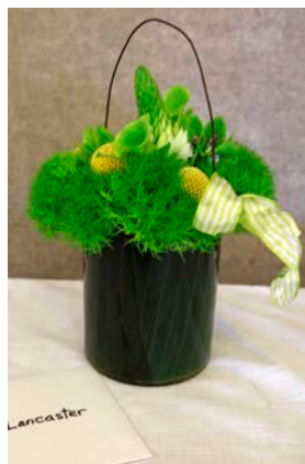
Candy Lancaster's bucket of blossoms