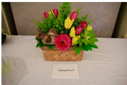
Marilee Ahalt's colorful basket