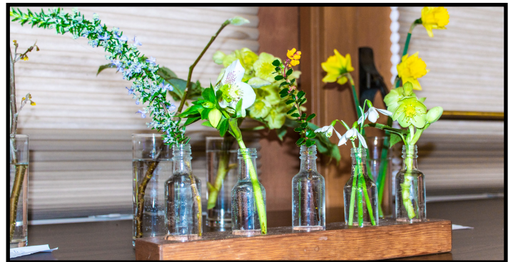
We really enjoy Hort Share. Thank you for participating!