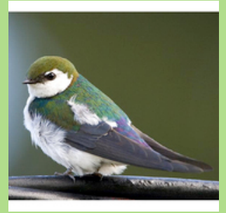
Violet green swallow

I believe most of us are quite glad to throw this past winter away and focus on enjoying the blooms and birds in gardens. Particularly prolific right now are the sweet song sparrows and house wrens that are often seen at feeders but also are insect-eaters. The cedar waxwings with their Zorro type masks are about, as are the melodic red winged blackbirds. Robins are out in force after garden worms, as are a few varied thrushes. I haven't seen my favorite, the Swainson's thrush with its beautiful song, but the CUH trails are full of violet green swallows, my second favorite.