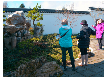
The sun appears during the tour of the Seattle Chinese Garden