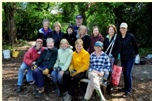
Last year's happy band of Wetherill workers