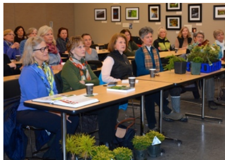
SGC Members enjoy the presentation on conifers