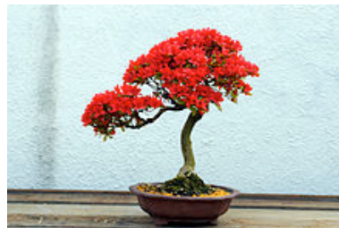
Bonsai persimmon in the U.S. Arboretum, presented to President Reagan by HM Hassan II, King of Morocco, 1983