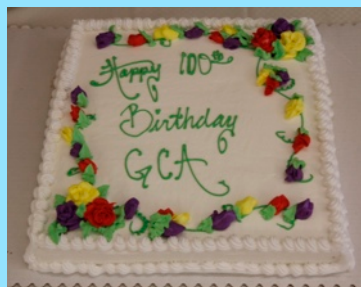
We all enjoyed the GCA Birthday cake!