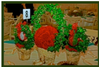
One of many outstanding table creations