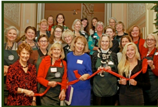
Cheers to our dedicated Ways & Means Committee and volunteers!