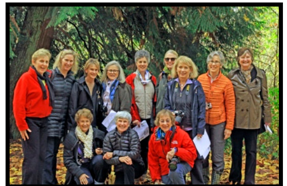
Taking a break from photographing and identifying native plants for a group shot on a splendid fall day