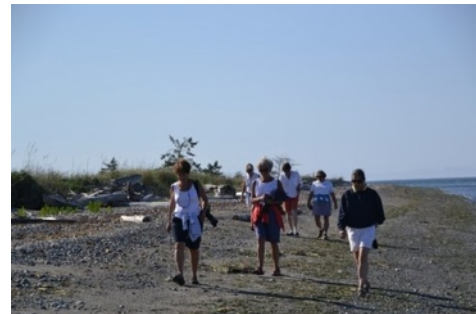
Enjoying a stroll on the beach at Graymarsh Farm