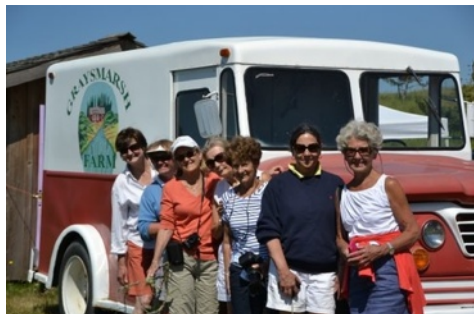
Smiles all around at Graymarsh Farm