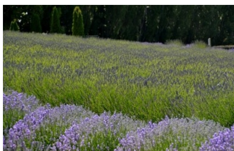
Fields in bloom at Graymarsh Farm