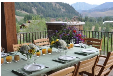
A beautiful dinner awaits guests at Sun Valley