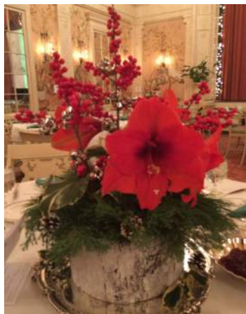
Vicki Reed's centerpiece featuring vibrant amaryllis