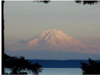
Sheila's view from her B.I. home.

Bring your own blanket Very limited sit-down tables.