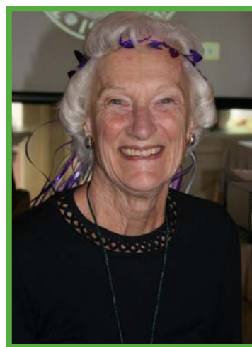
Photo taken in June 2007 at SGC's Annual Meeting honoring SGC past presidents.

a member since 1973, died on Thursday, August 25, 2011