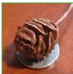
Coastal Redwood Cone

One of my favorite pinecones is that of the coastal redwood. It is tiny, serotinous (propagated by fire) and gives a most satisfying sound when added to a fire. I didn't realize that I might not be able to enjoy these cones had it not been for Garden Club of America.